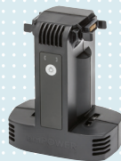
757L38 dual bay charger