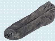
SL=Spectra-sock-7 Spectra sock