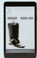
743Y840=V1 Empower tablet