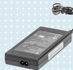
757L39 power supply