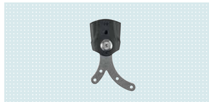
Aqualine Ankle Joint