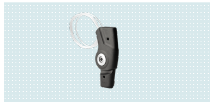
Aqualine Knee Joint