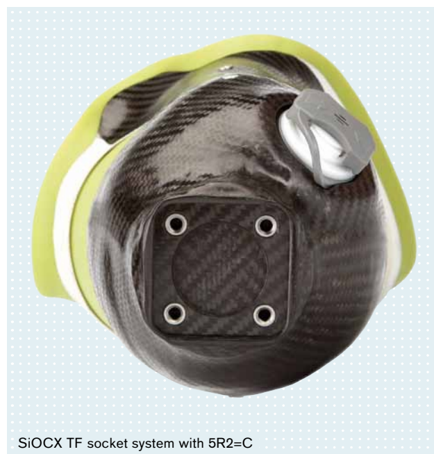
SiOCX TF socket system with 5R2=C