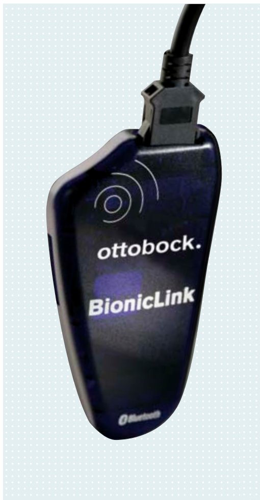
• BionicLink 60X3