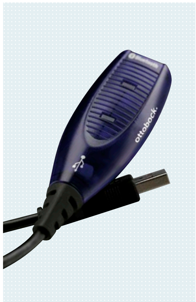
• BionicLink PC 60X5