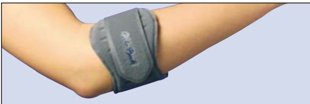
Fig. 2: Epi Forsa Plus Brace

injection of bupivacaine hydrochloride (Marcaine) 0.3 ml and triamcinolone acetonide, 10 mg/ml (Kenacort) 0.2 ml into the area of maximal tenderness at the lateral epicondyle. Follow-up, including subjective and objective outcome, was done at the clinic after 2 weeks, 3, 6, and 12 months. In subjective as well as objective outcome a significant difference between the groups, favouring the steroid injections, was observed only after 2 weeks: P < 0.001 and P < 0.05 , respectively. After 3 months there was no significant difference between the treatment groups. In conclusion, in the long-term treatment of lateral epicondylitis an elbow support brace is as effective as local steroid injections (16).