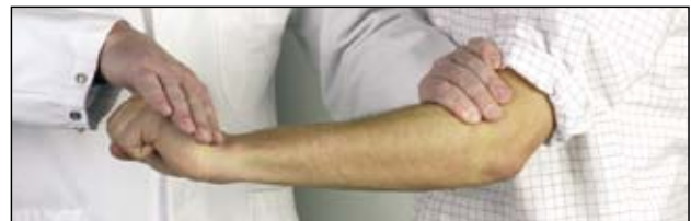
Fig. 3 and 4: Extensor-Grip-Test