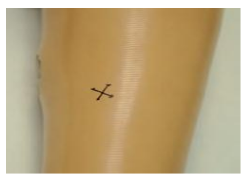
Find the center by joining the four position points, as shown.