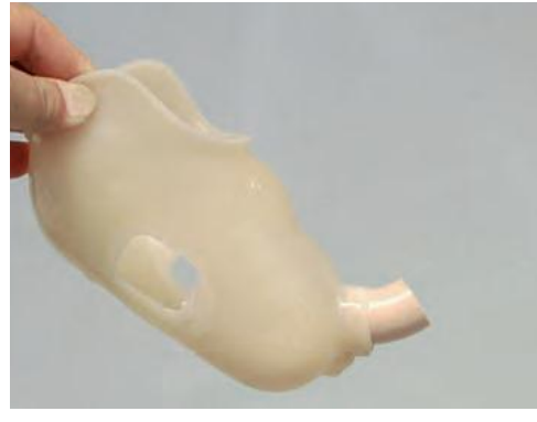
Install the pull-in tube into the socket. Assemble socket and forearm shell with screws (503F3) and drive nuts (29C5=M4x9).

Ottobock has created a handy tool for centering a pull-in tube on an upper limb socket. The magnetic positioning means that you can get the exact placement of the tube while working from the inside of the socket and still mark the drill placement on the outside of the socket.